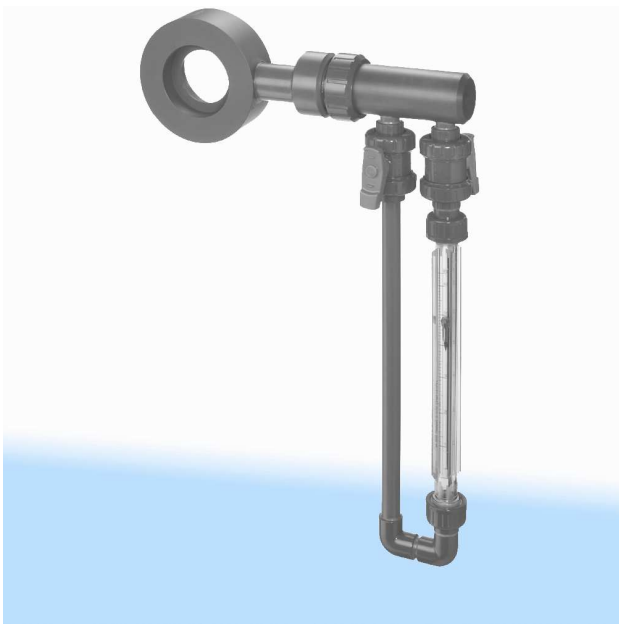
Fig. 1 F O N4 orifice flowmeter